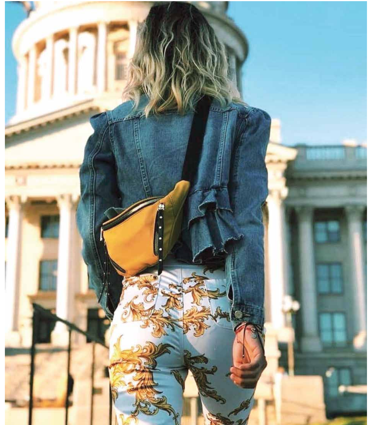
INSTAGRAM INFLUENCER FOR BOOM BOOM JEANS